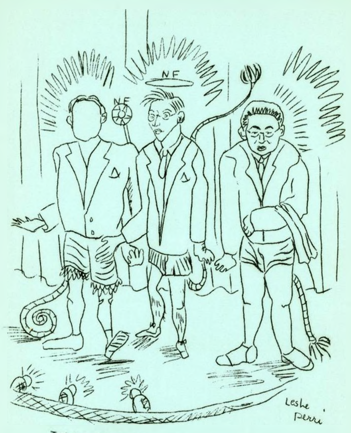
TYRANNOUS UNHOLY TRIO WE